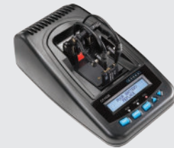
C5100B STOREFRONT ANALYZER