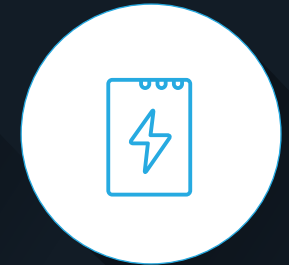
Complex Battery Contacts

Cadex Electronics, Inc. Visit cadex.com/adapters for more information Enquiries: info@cadex.com