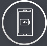
Embedded Smartphone battery