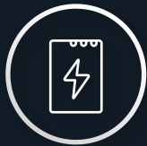
Narrow and awkwardly placed battery contacts