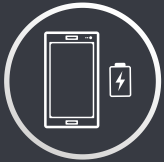
Removable Smartphone or small rechargeable battery