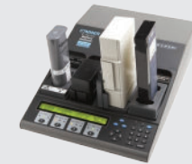
C7X00 PROFESSIONAL ANALYZER