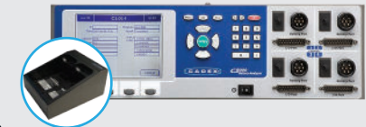
C8000 LAB ANALYZER