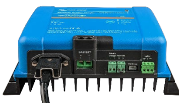
Phoenix Smart 12/50(1+1)