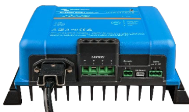
Phoenix Smart 12/50(3)