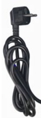
AC cord (must be ordered separately)

Plug options: Europe: CEE 7/7 UK: BS 1363 Australia/New Zealand: AS/NZS 3112