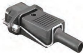
Retainer clip (included)