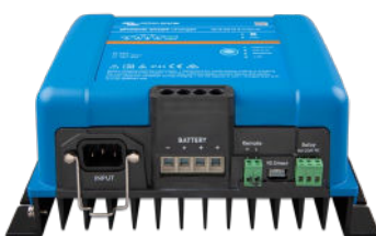
Phoenix Smart 12/50(3)