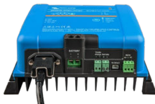
Phoenix Smart 12/50(1+1)