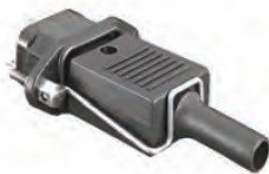
Retainer clip (included)