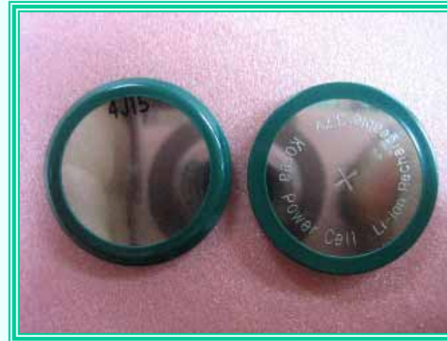
■ SH : Shrinkage Tube