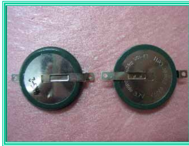
■ TS8 : 180 °