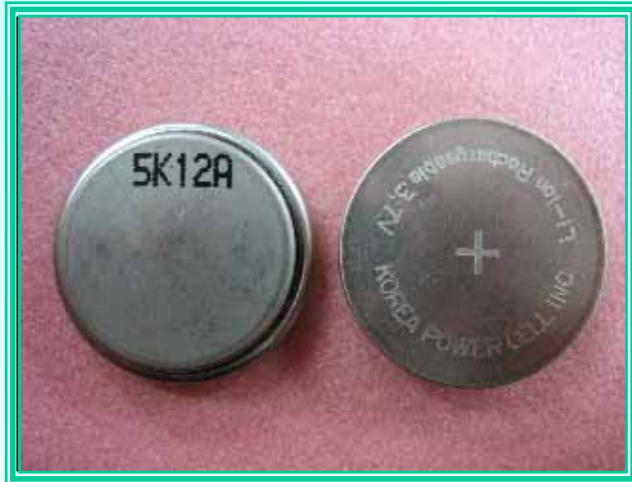
■ BC : Bare Cell