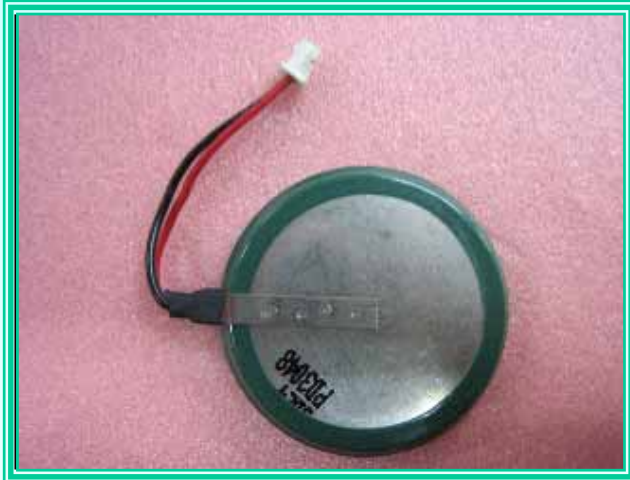
■ WAM30 : with Molex Pin