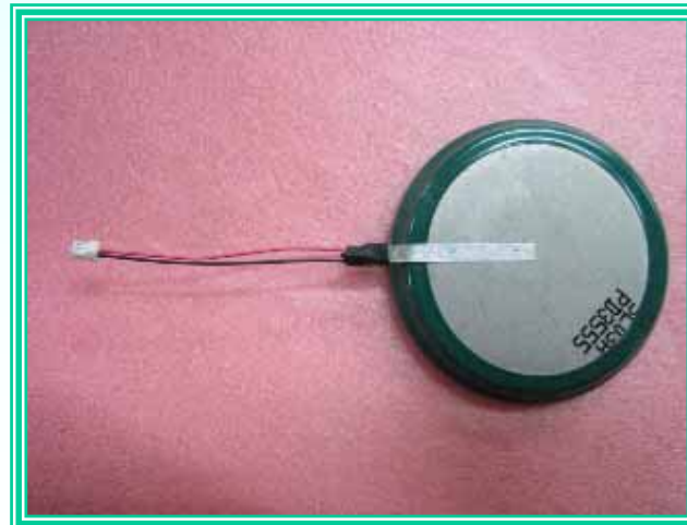
■ WAJ30 : With JST Connector