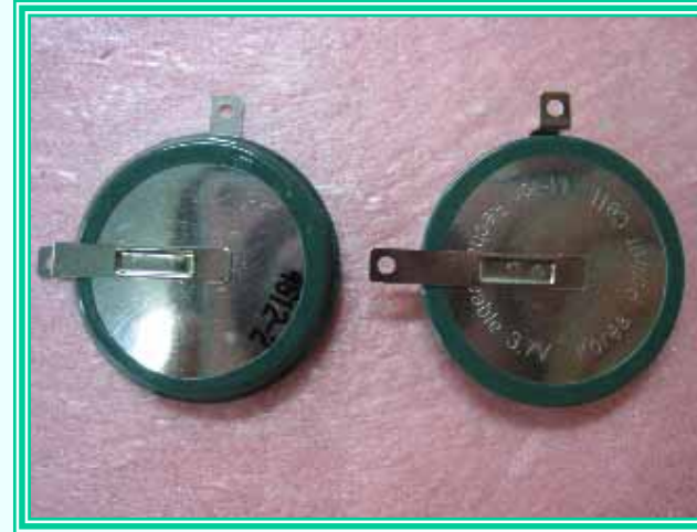
■ TS9 : 90 °