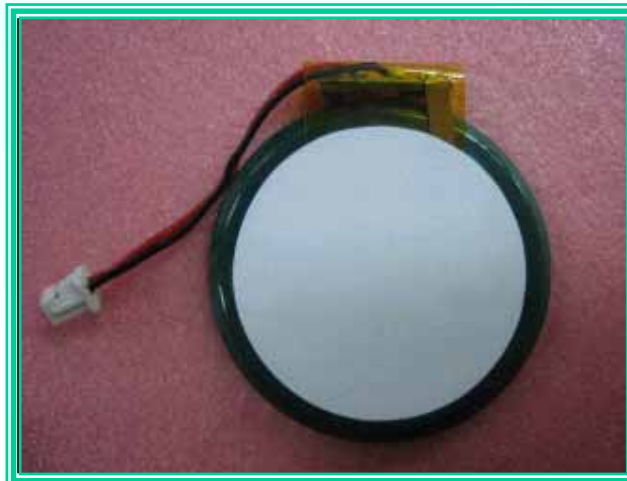
■ HPWM30 : HPCM with Molex Pin