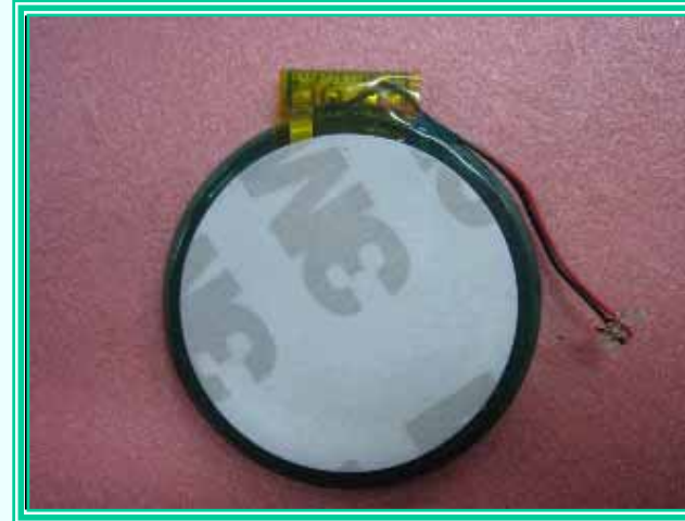
■ HPWK30S : HPCM with Kyocera Pin (S Company Type)