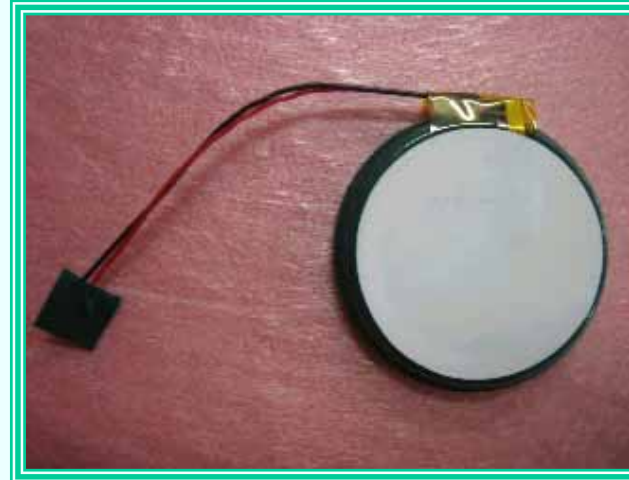
■ HPW60 : 60mm Wire with HPCM