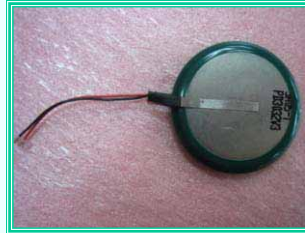
■ WAK30 : With Kyocera Pin