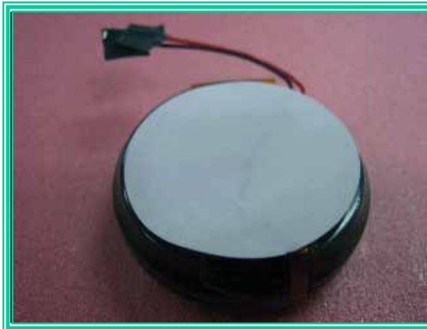
■ HPW60_2P : 2 Cell Parallel