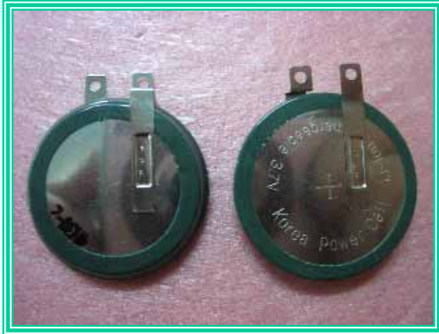
■ TS1 : 0 °