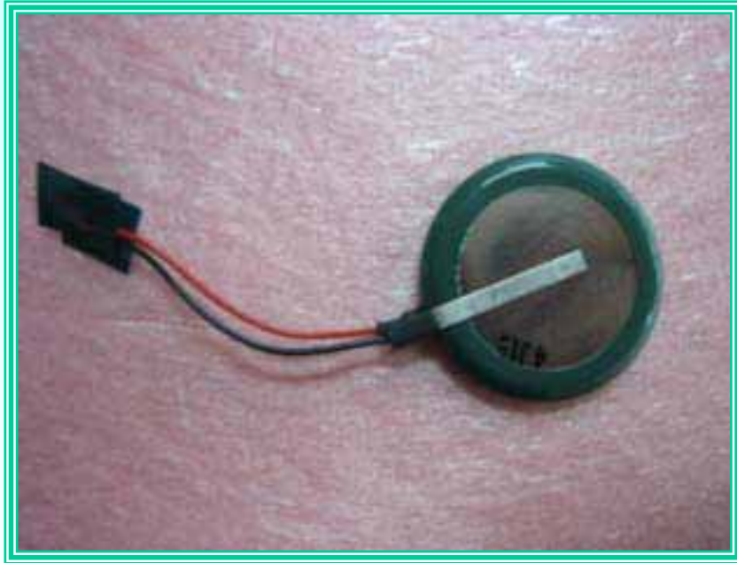
■ WA30 : 30mm Wire