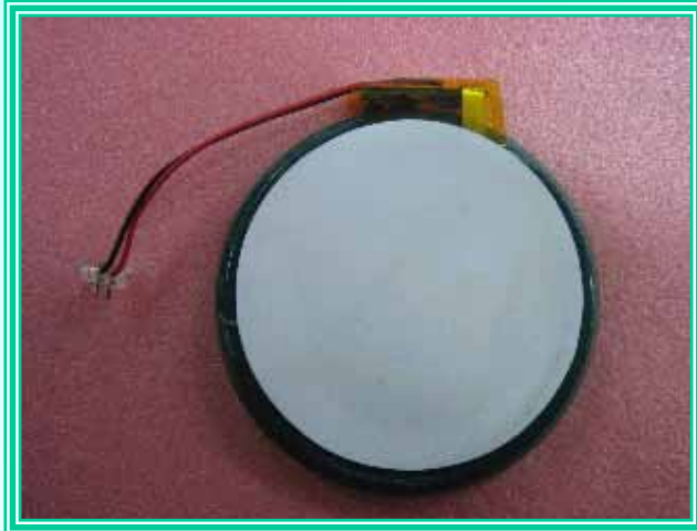
■ HPWK30 : HPCM with Kyocera Pin