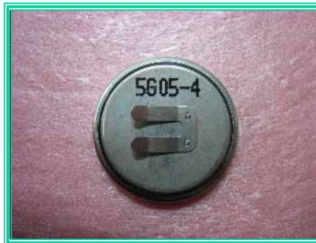
■ BCS : BC with Spring